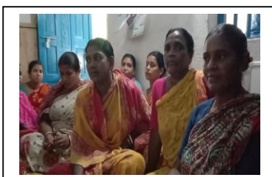
Consumer Affairs Programme

ShilparghyaJalkhura provides medicines to the needy at Shilpagram, Giletala, Falta, South 24 Parganas throughout the year.