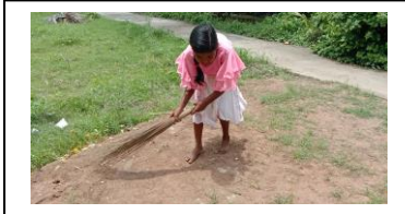
Child Labour Programme