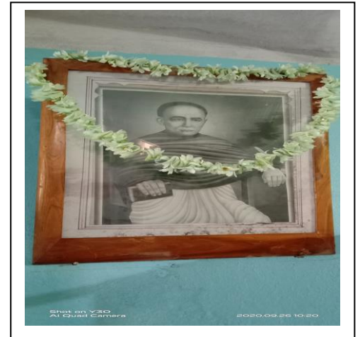
Iswar Chandra Vidyasagar