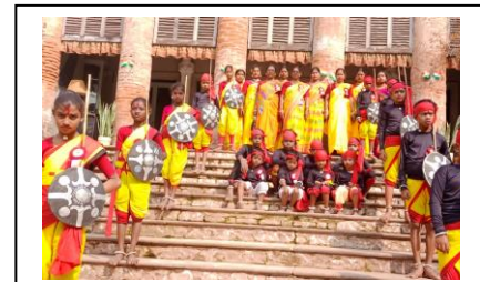
Program at Bawali Raj Bari