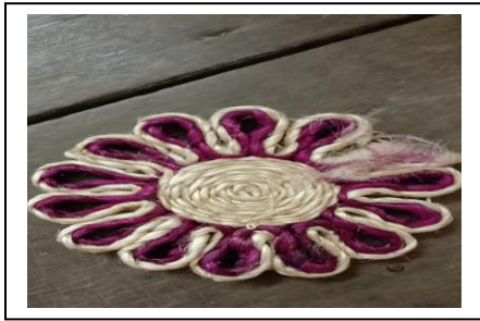
Our Handicrafts Products