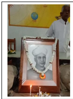
Dr Sarbapalli Radhakrishnan