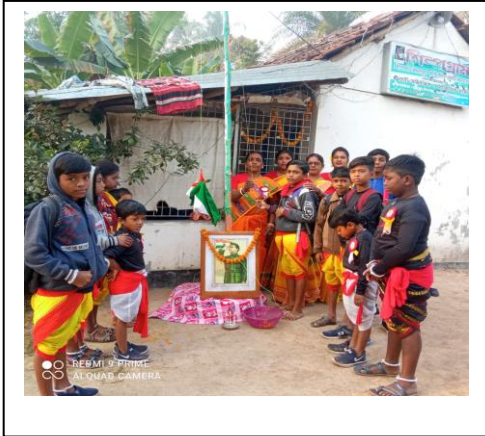
Netaji Subhas Ch Bose