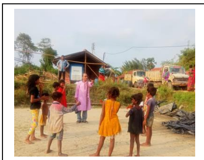
Training to brick field Migrated Children