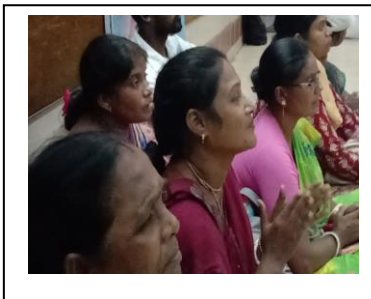
Self help Group Sensitization Camp.

As part of its advocacy programme we work to make people to aware about the rights of Indigenous people. These activities run from Haribasari of Burul to Kantakhali of Falta, South 24-Parganas throughout the year. Punch line of this campaign is that every people have rights to live with dignity, every woman and children has right to be literate.”