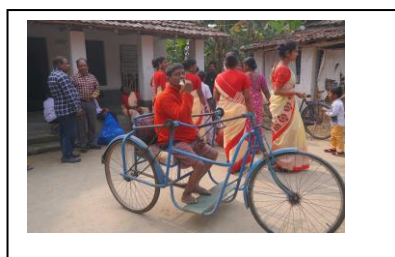
Physically Challenged Welfare Programme