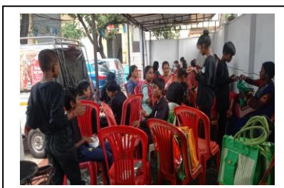
Mother & child health care.

Another health camp for all was organized at Shilpagram, Giletala, 24-Pgs(s), on 3 rd December, 2023. Doctors were present for Health Check-up, Blood Sugar Test, ECG etc. More than 50 people were treated and Diagnosed in the camp. We also provided them medicines and also provided them with information regarding precaution from communicable diseases.