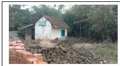
Development of Shilpagram