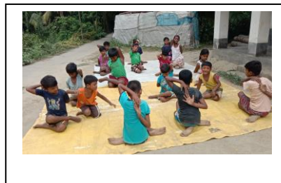
Seminar on Yoga