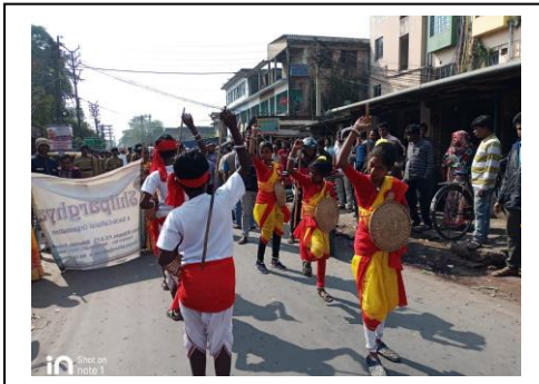
Road Show at Bibir Hat